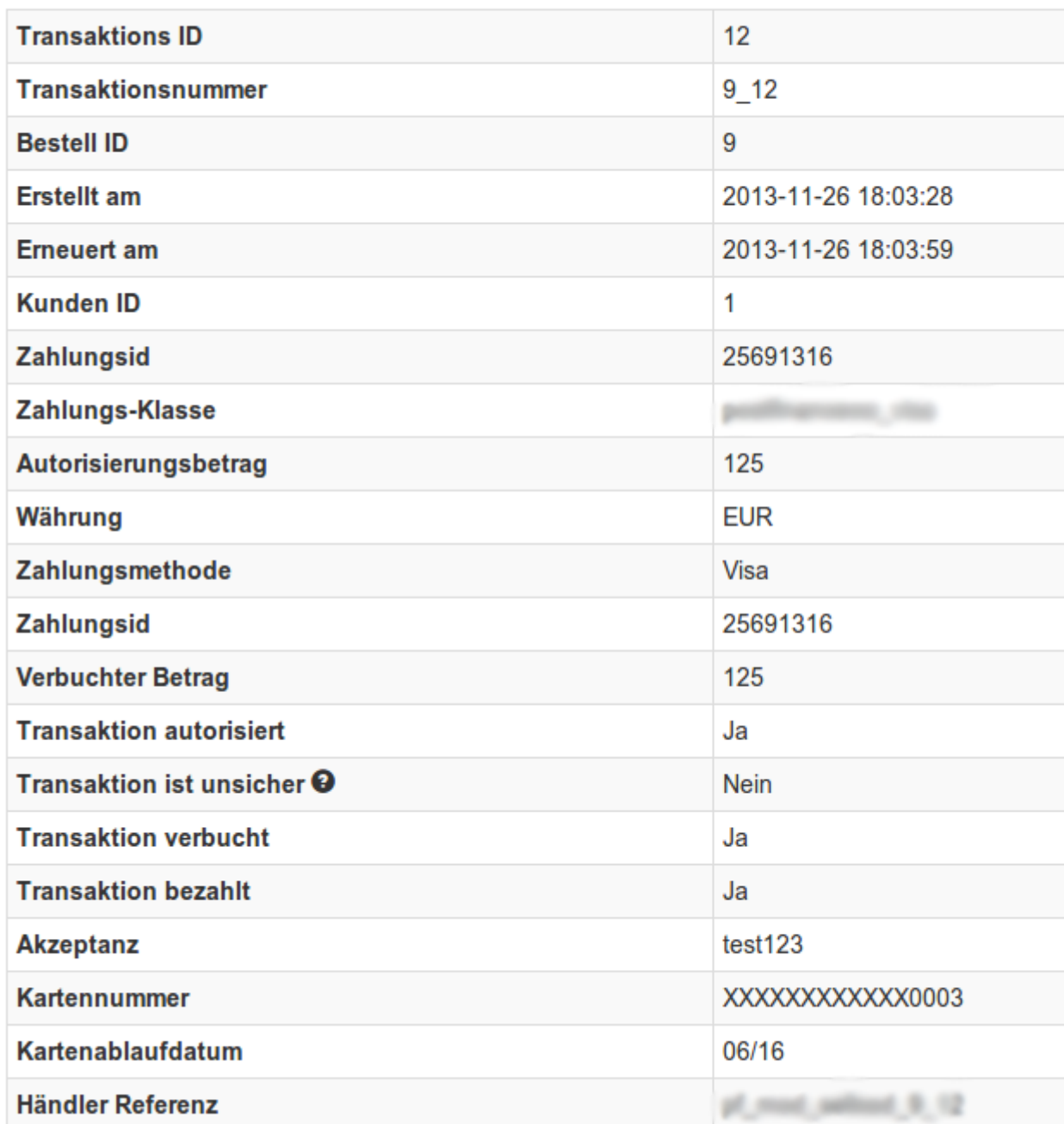
Figure 6.1: Transaction Information