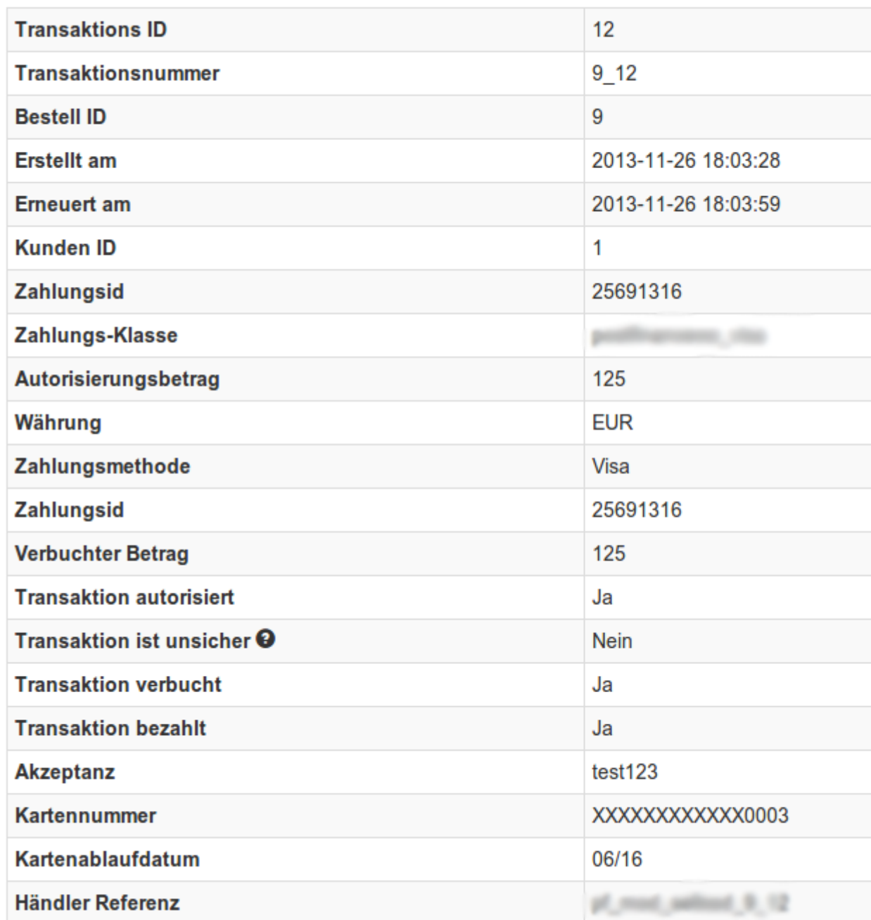
Figure 6.1: Transaction Information